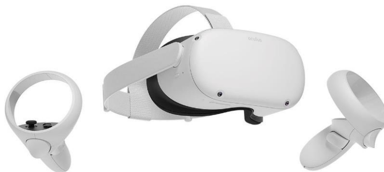
Figure 1. OCULUS VR Headset.

Two senior lecturers and twenty-five students from different levels representing the Faculty of Medicine and Defence Health participated in this study. Oculus VR headset has been used as a display tool. 3D simulation of the muscular system has been installed from OCULUS (see Figure 1 ).